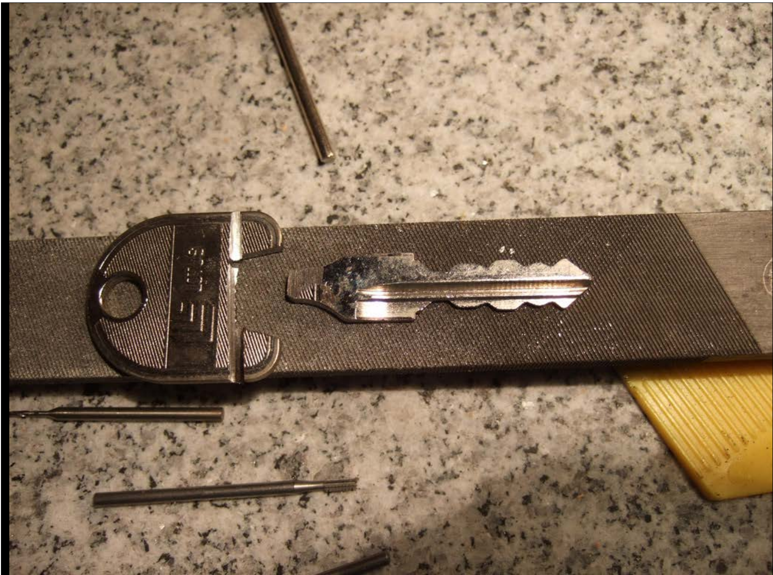
Newly cut key below blanks from keyfob, showing what needs to be removed in order to fit within the remote key enclosure: