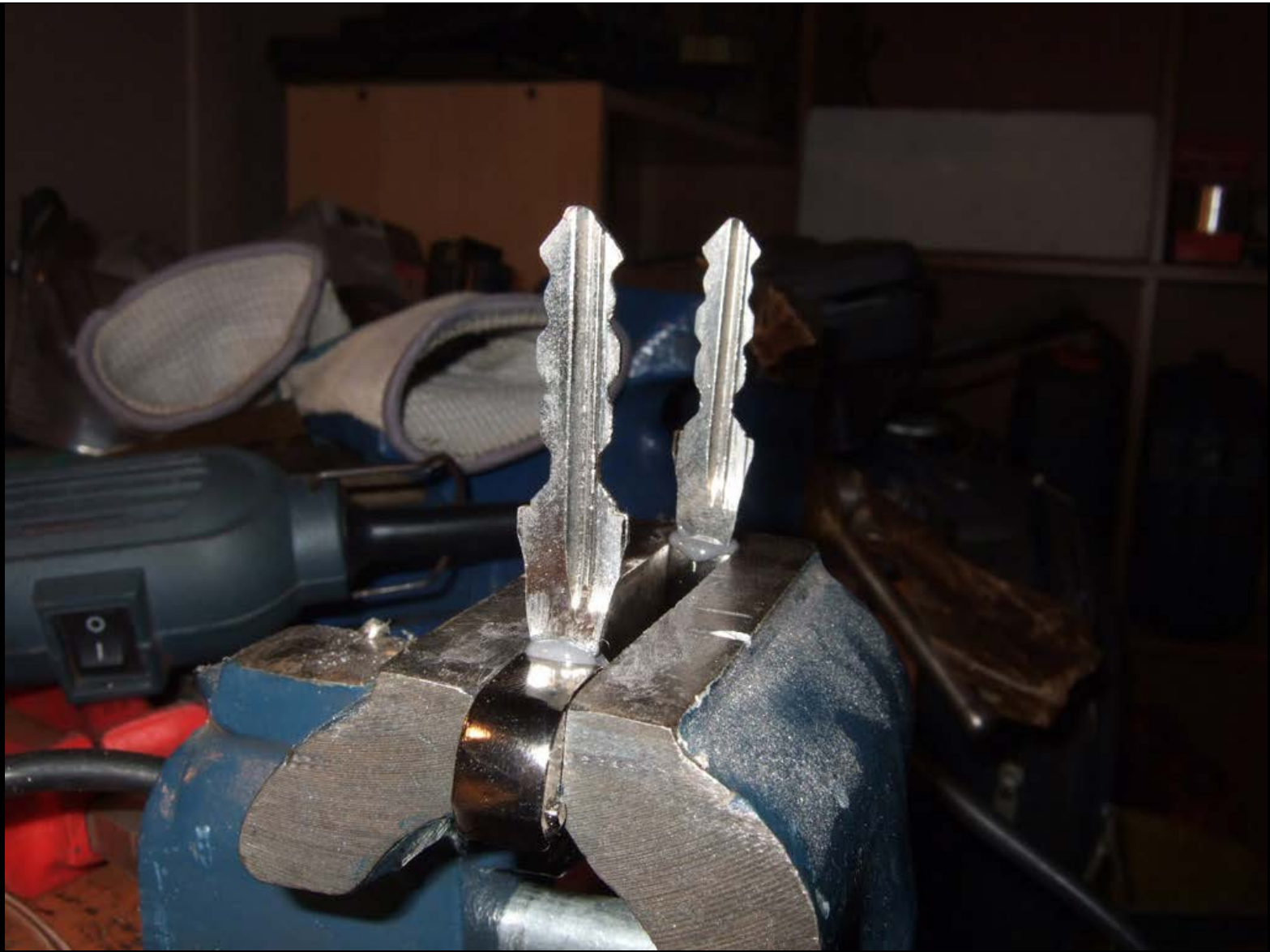
Removed excess glue and re-assembled the keyfob.