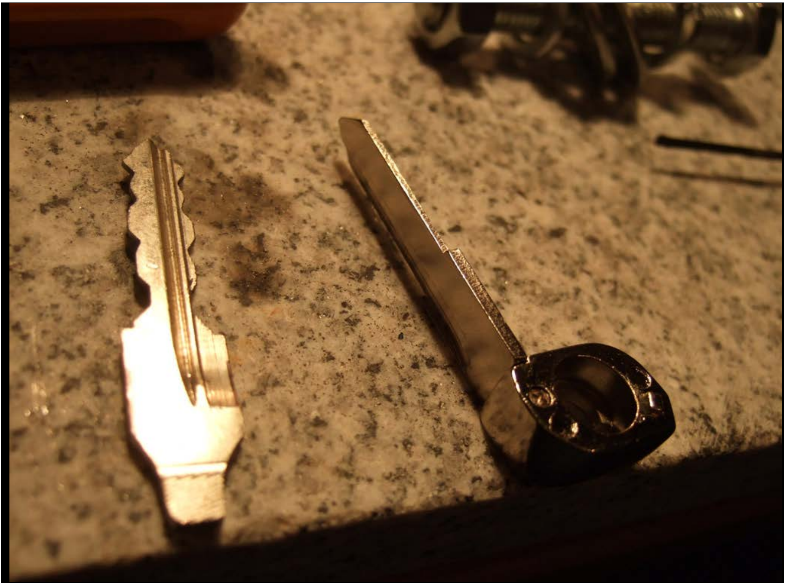
Had to skim them about 0.5mm, don't worry though, the key won't bend!