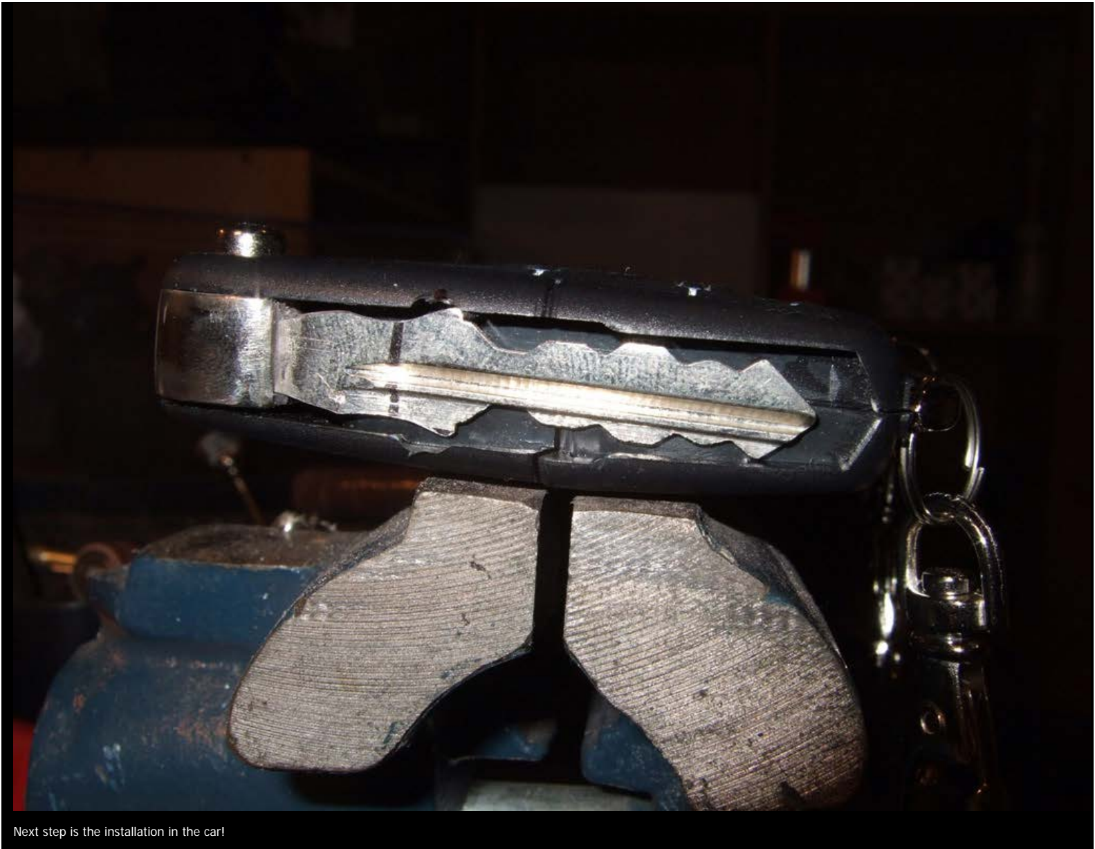
Next step is the installation in the car!