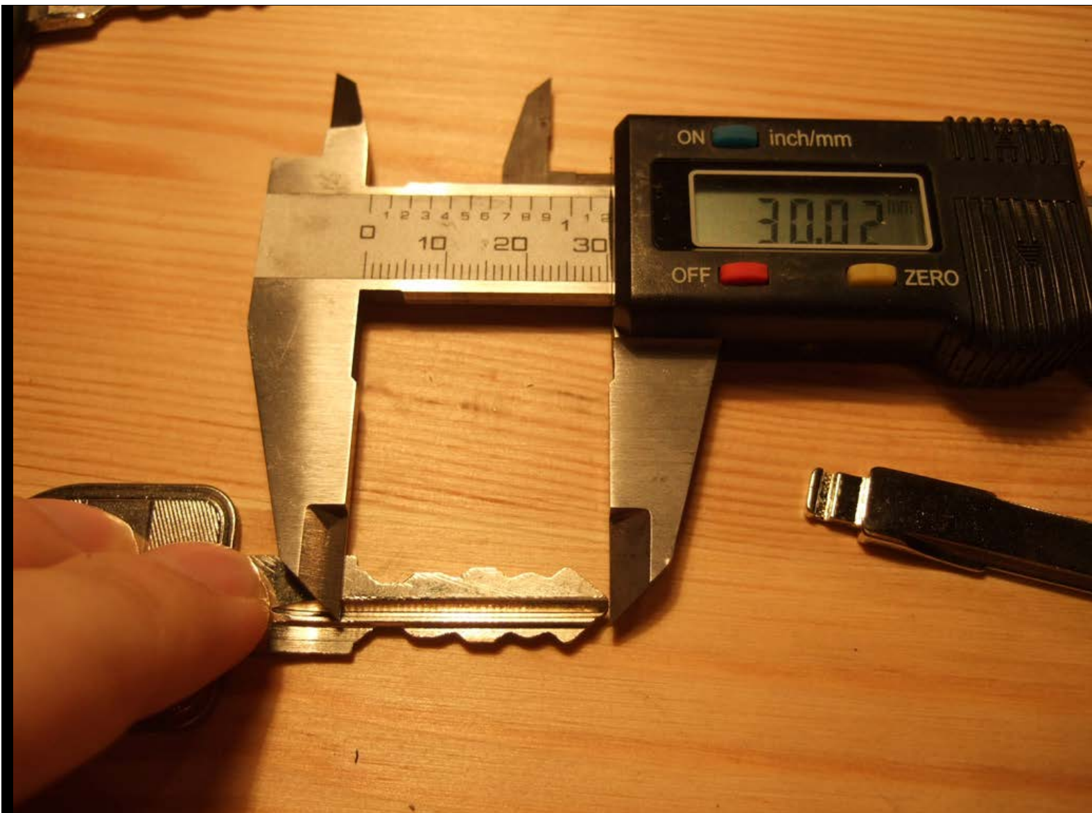
Using an angle grinder (yes it's a hard material) I cut the first and second key: