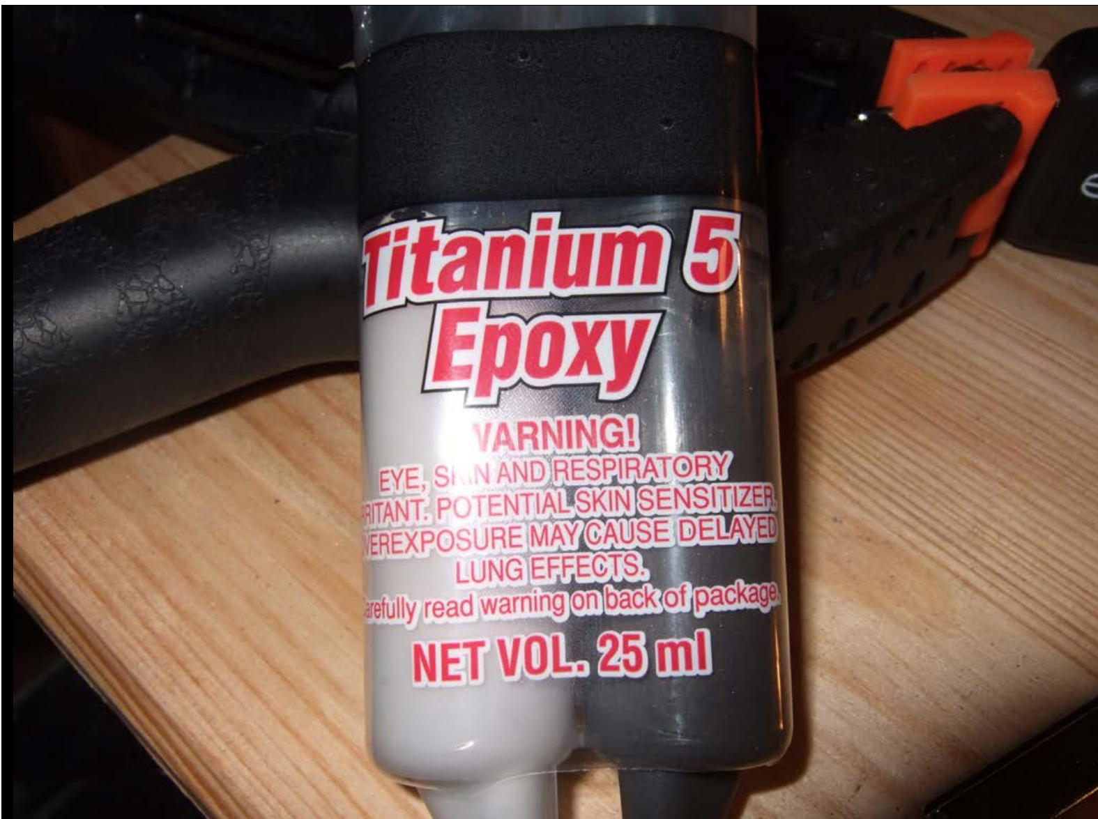
Applying glue, aligning and letting it harden.