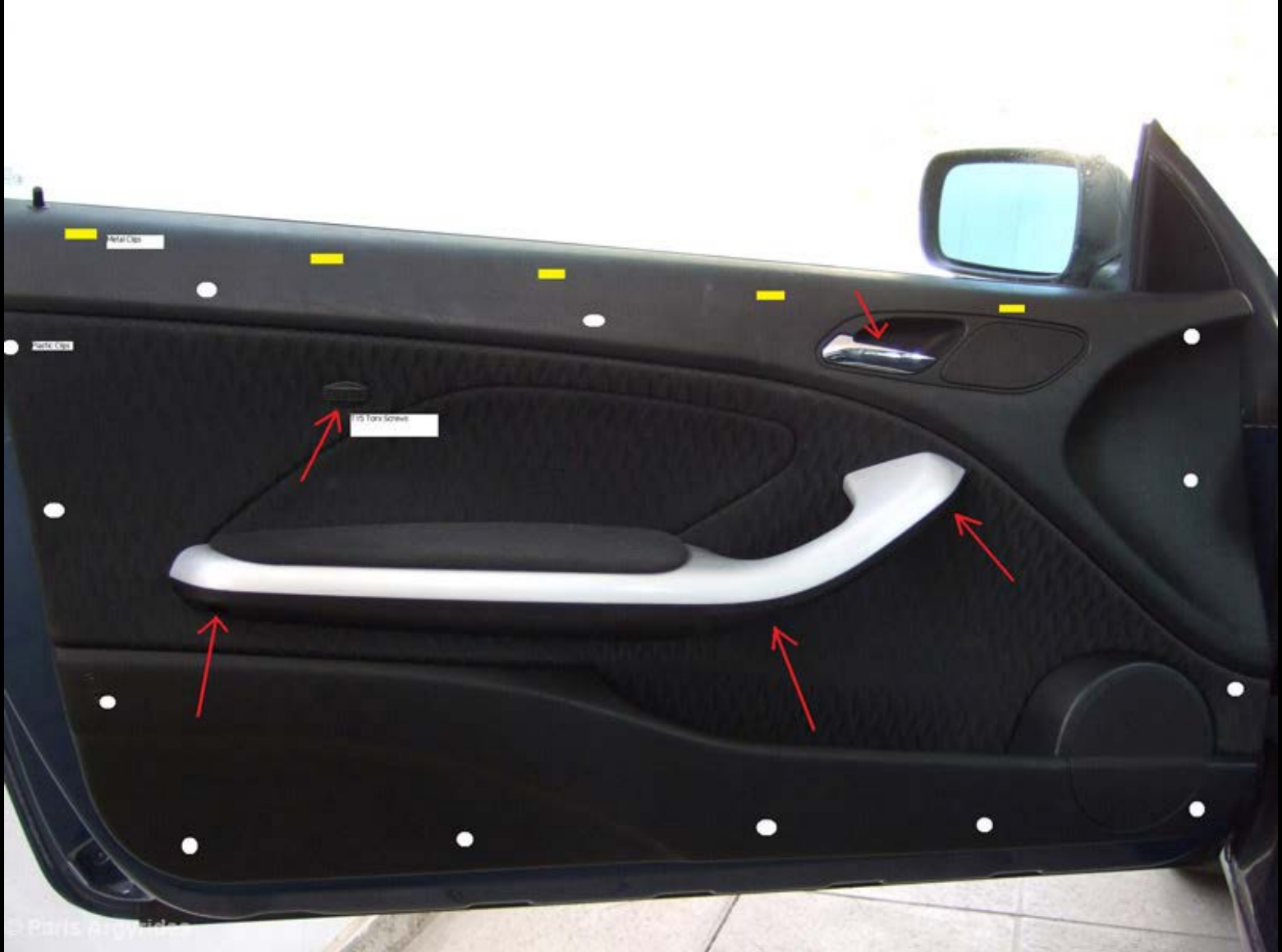
Closer at the armrest

As the picture illustrates there are 5 Torx (T15) screws that need to be removed. 3 long screws are along the armrest, 1 is behind the plastic airbag cover and another one inside the door handle. The white round circles demonstrate the position of plastic clips. When you pull the door out they come off and may break so have replacements ready. 11 on each door. The yellow rectangles show metallic clips that are used to secure the door card along the top of the door.