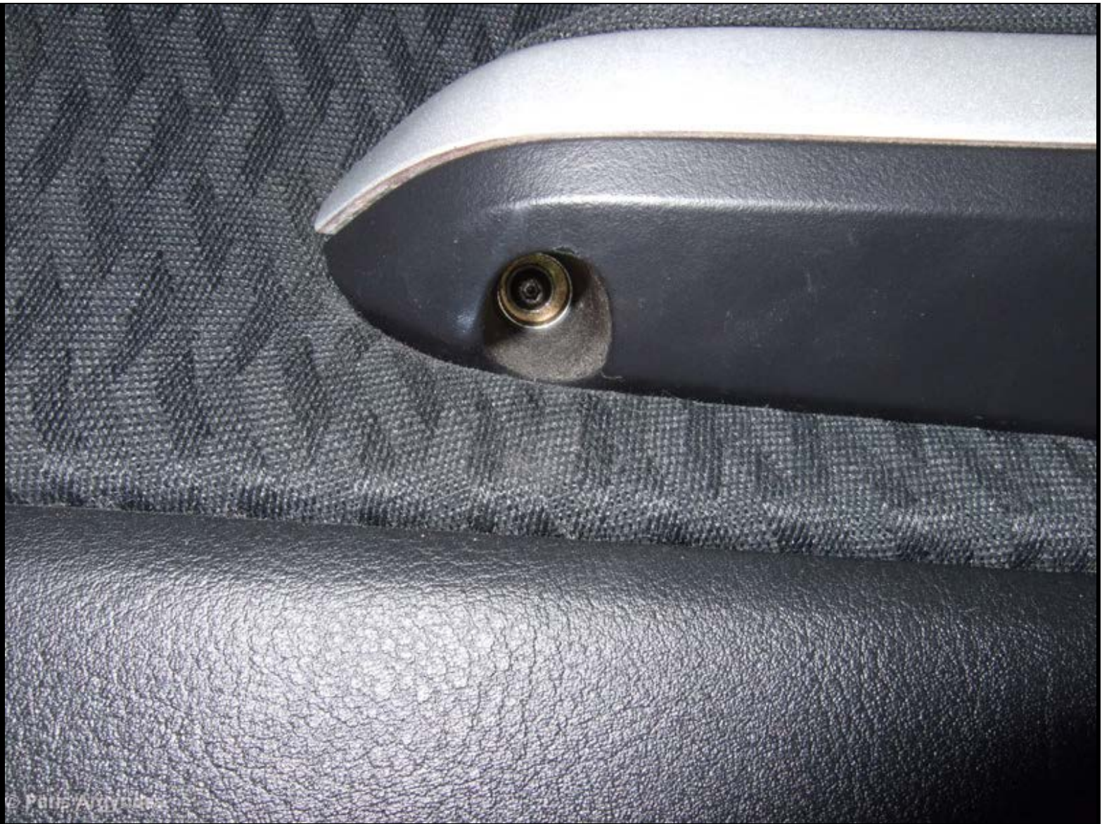
© Paul Argrydes Armrest needs a good respray but after the S/C install