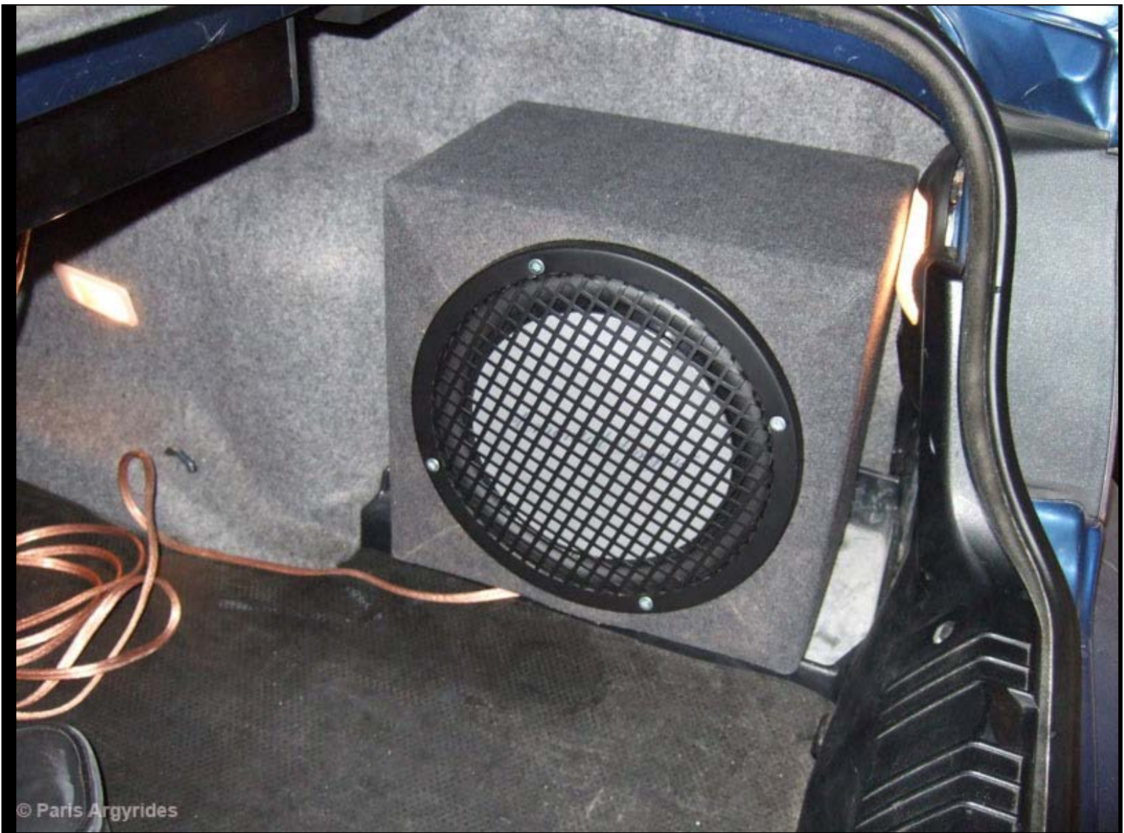
The bass control module of the amplifier.