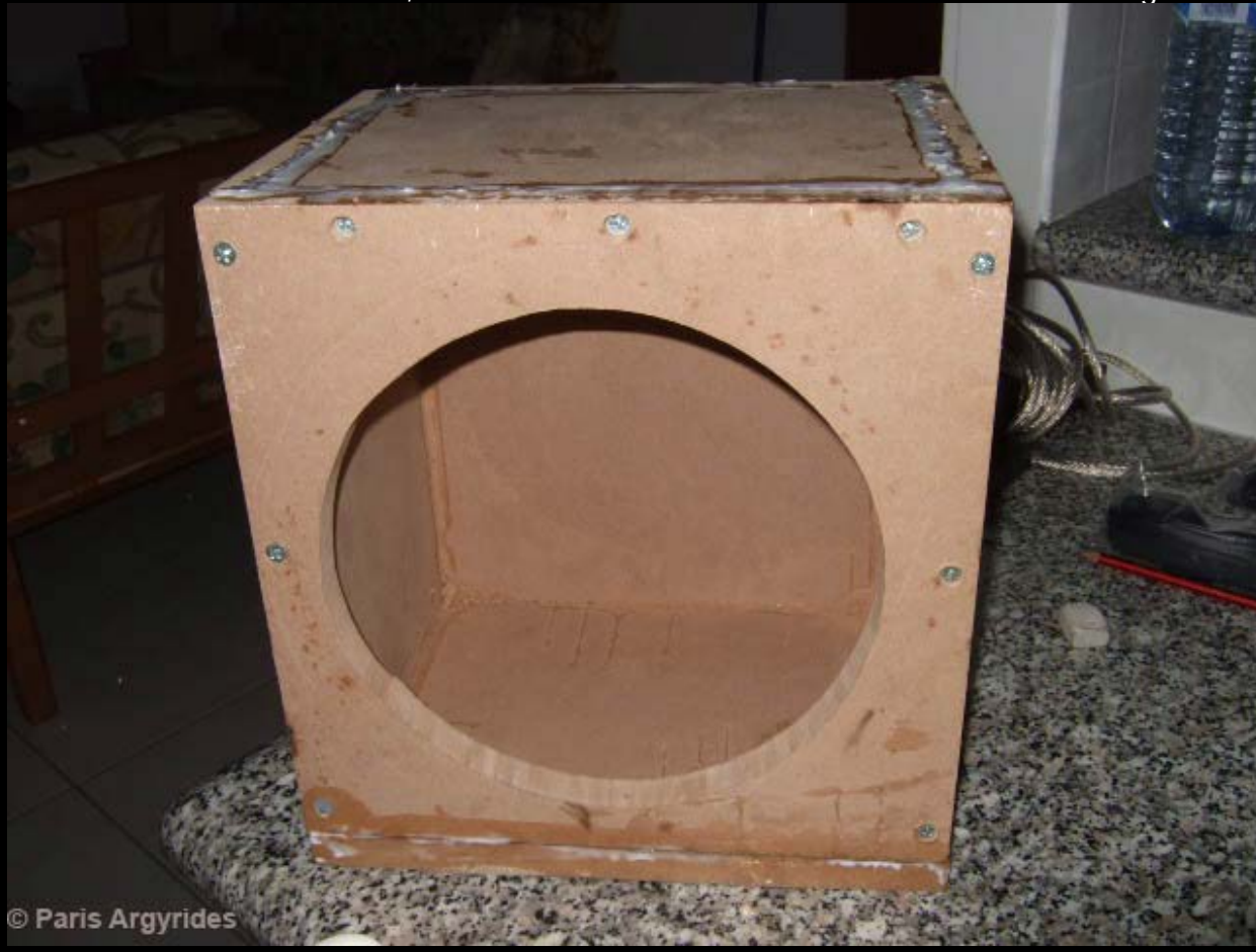
Sub box to exact dimensions, screwed and sealed with silicone sealant and wood glue