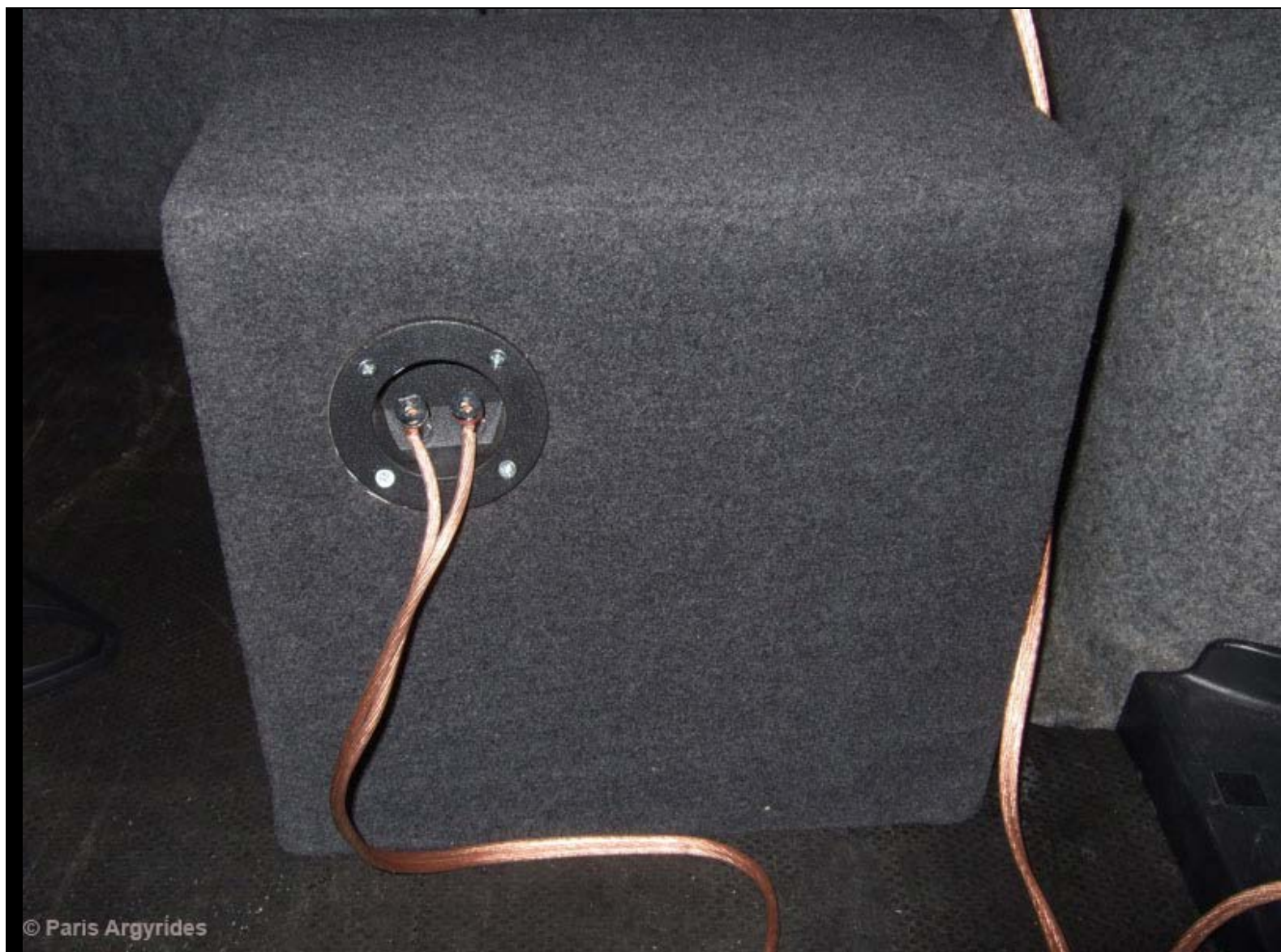
Port closer. There's a rubber gasket between the port and the box to seal properly